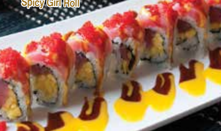
Spicy Girl Roll