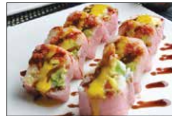
Spicy Mango Lobster Roll