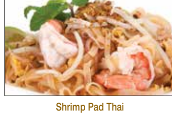
Shrimp Pad Thai