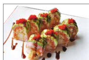
King Kong Roll