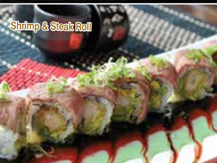
Shrimp & Steak Roll