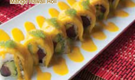
Mango Hawaii Roll