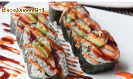
Black Queen Roll